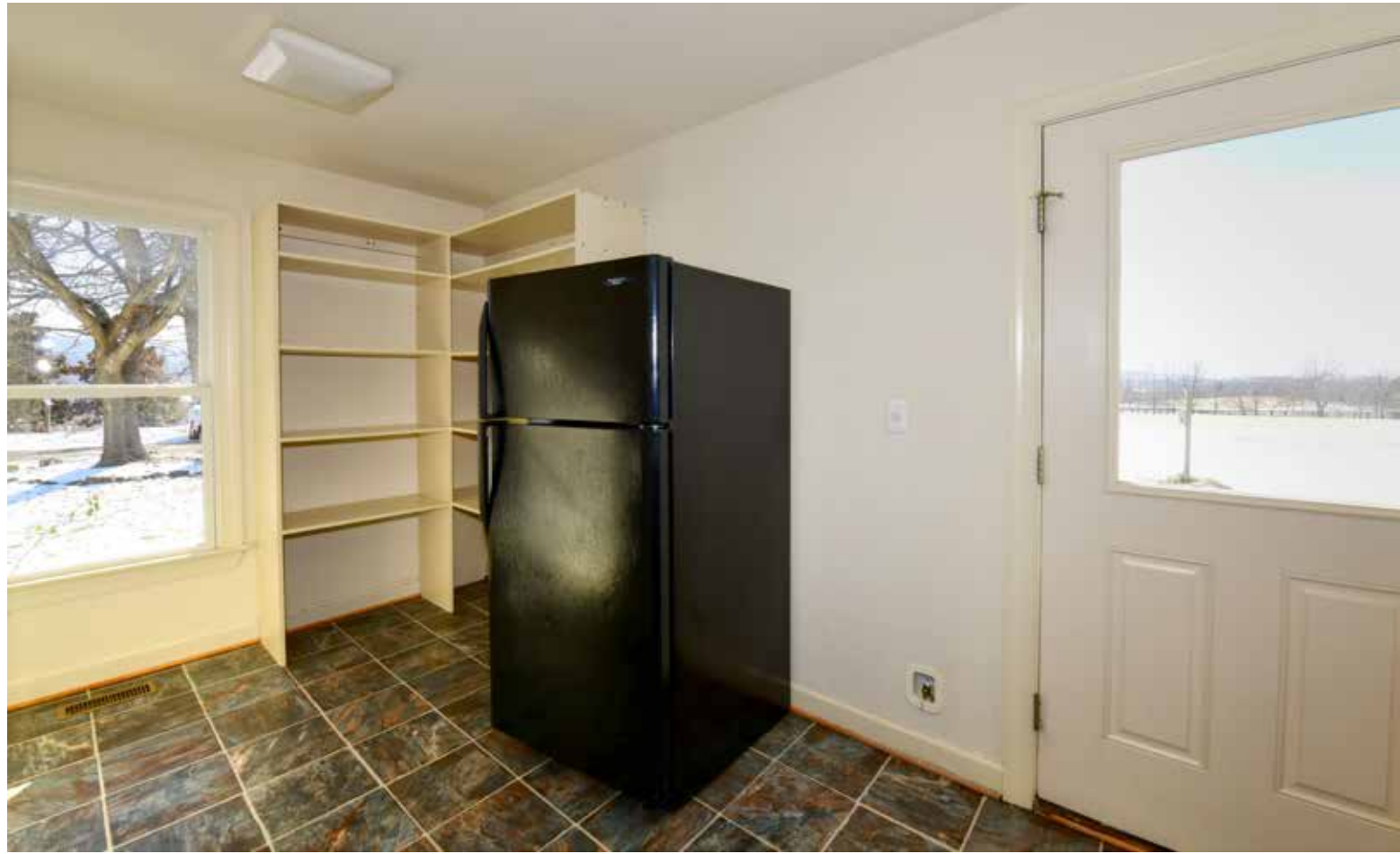
The Mudroom Laundry & Pantry